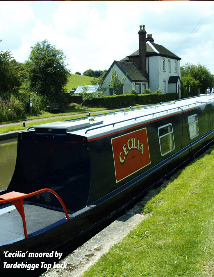
'Cecilia' moored by Tardebigge Top Lock