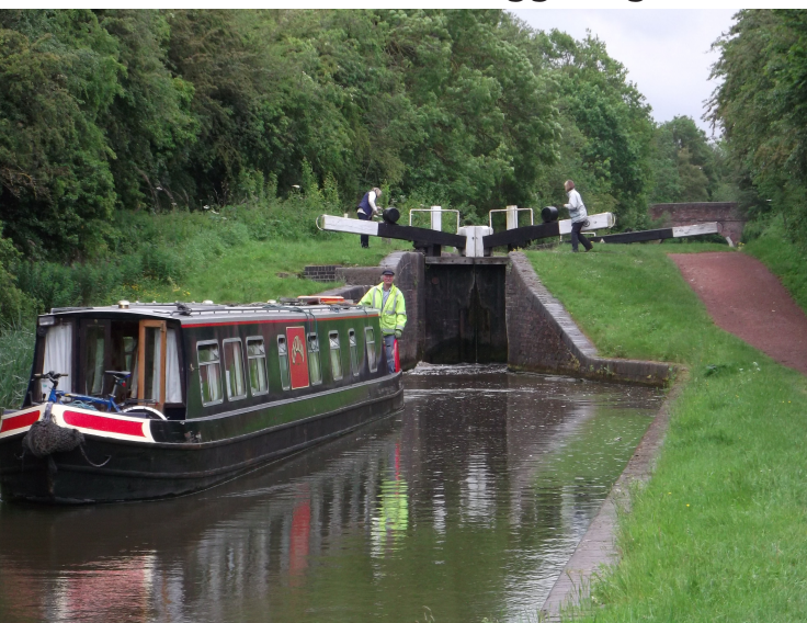
Map of the Worcester-Birmingham & Droitwich Canals