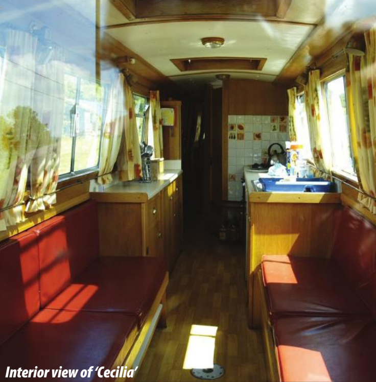
Interior view of 'Cecilia'